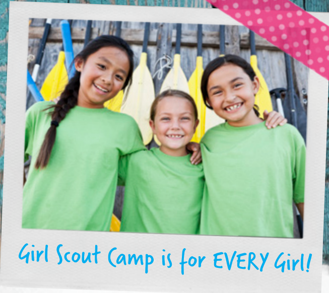
Girl Scout Camp is for EVERY Girl!

Girl Scout Camp is all about trying new things, making new friends, and having fun. You may get the opportunity to try archery, swimming, canoeing, hiking, adventure trips, STEM, gardening, horseback riding, and more. You can have a great summer at Girl Scout Camp exploring and learning! Camp is open to all girls entering 1st through 12th grade in Fall 2016.