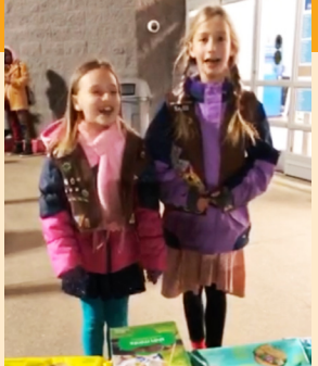
Greenville area Girl Scout Brownies in the 2019 Cookie Season

The Girl Scout Cookie Program is a powerful financial literacy tool that teaches girls important life and business skills that prepare them to empower themselves for a lifetime of leadership. Did you know that 100% of the proceeds stay local, between the council and the troops? We recently wrapped up our 2019 Cookie Program and we're proud to report overwhelming success even with ice, rain, and school closings and delays due to weather. Troops who participated not only learned how to run a business, but also generated substantial funds for their troop to attend programs, travel, run community-based service projects, and ultimately have more leadership building experiences.