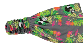
Cooling Headband 150+ pkgs