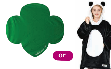
Panda Hooded Blanket OR Customized Trefoil Blanket 700+ pkgs