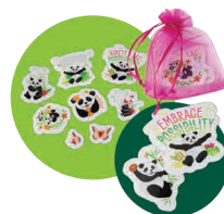
Theme Decal Set 100+ pkgs