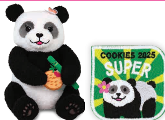
"Mei Lan" the Panda AND Super Patch 350+ pkgs