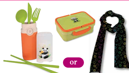
Take-Along Utensil Set AND Bento Box OR Scarf 400+ pkgs