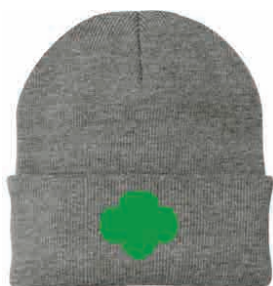
Trefoil Beanie 300+ Initial Order pkgs