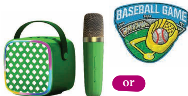
Trefoil Karaoke Machine OR Council Baseball game Dates: TBD 850+ pkgs