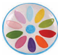
Pottery/Art Experience (Columbia) Date: April 5th Pottery/Art Experience (Spartanburg) Date: April 12th 1000+ pkgs