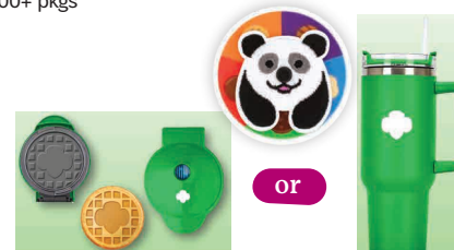
Action Patch AND Trefoil Waffle Maker OR Trefoil Tumbler 1500+ pkgs