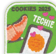
Techie Patch 25+ pkgs