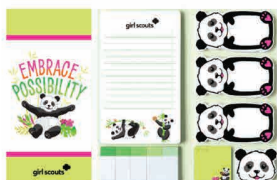
Panda Stationary 250+ pkgs