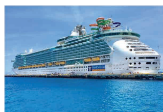
Cruise Date: June 16th - 21st 5 day cruise OR Free Week of Summer Camp 3000+ pkgs