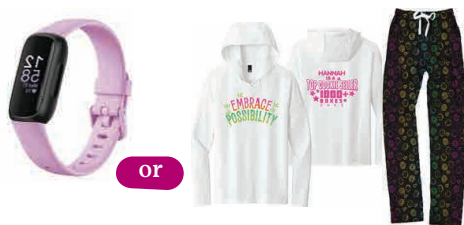
Fitbit Activity Tracker OR Pajama Set 2500+ pkgs