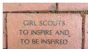
Cookie Hall of Fame Brick 2750+ pkgs