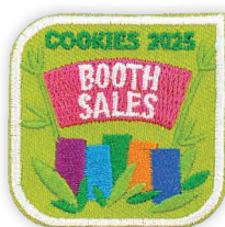
Booth Sales Patch 100+ pkgs