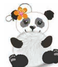
Panda Pom Pom 200+ pkgs