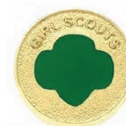
2025-2026 Girl Scout Membership 600+ pkgs