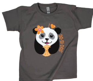
Panda Do-si-dos® T-shirt 350+ PGA shirts for each girl selling plus 2 Volunteers