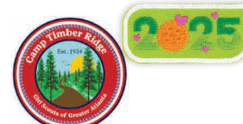
Camp Timber Ridge Weekend, Atlanta Date: May 2nd - 4th AND 2025 Year Bar Patch 2025+ pkgs