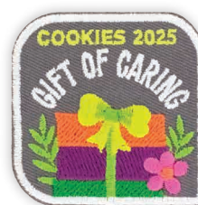
Gift of Caring Patch 25+ GOC