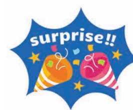
Surprise Experience on Cruise OR Camp Care Package 4000+ pkgs