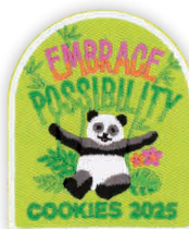
Embrace Possibility Patch 50+ pkgs